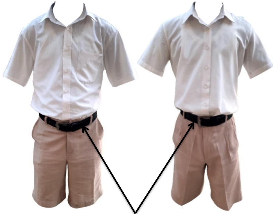
Recommended belt for male students